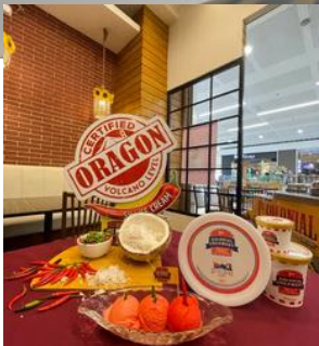
Sili Ice Cream

Satisfy your taste buds with the different Bicol dishes and delicacies offered