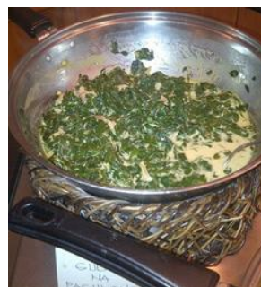
Gulay na Pagulong