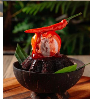
Mayon Lava Cake